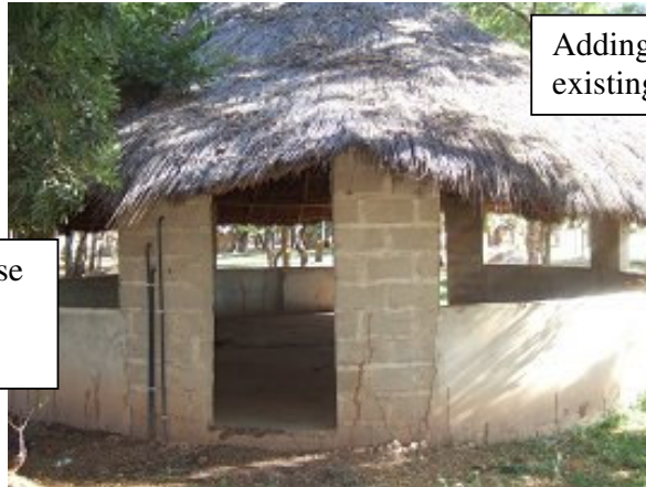
Adding brickwork to existing round house £116.

These are some of the things we are hoping to fund within the Play-Park in order to make the area safe and enjoyable for disabled and able-bodied children to experience together. With your help Health Help International can make it happen and we hope that you too can enjoy learning about the Zambian way of life and the problems facing some of the children whom we aim to help within town of Monze, Southern Province.