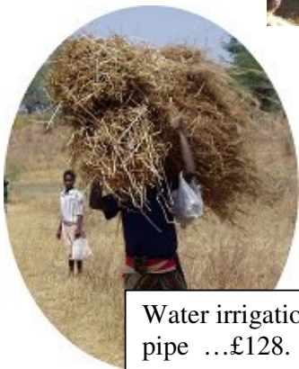
Water irrigation pipe ...£128.